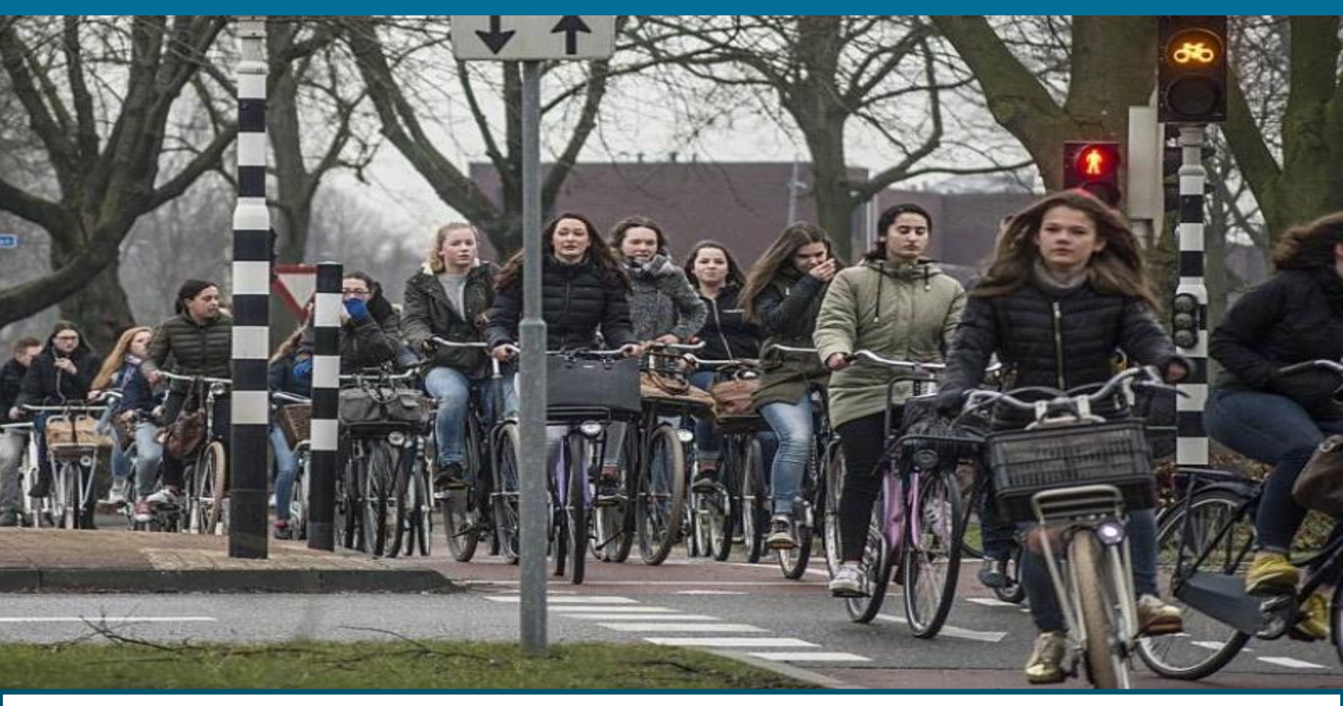
Bike traffic jams