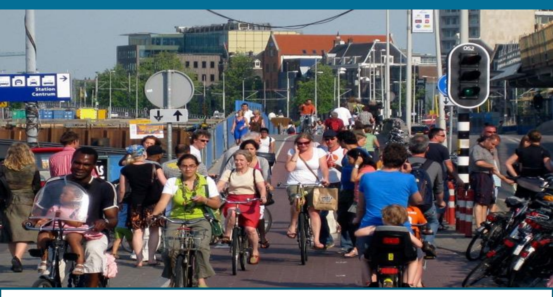
Cycling is important