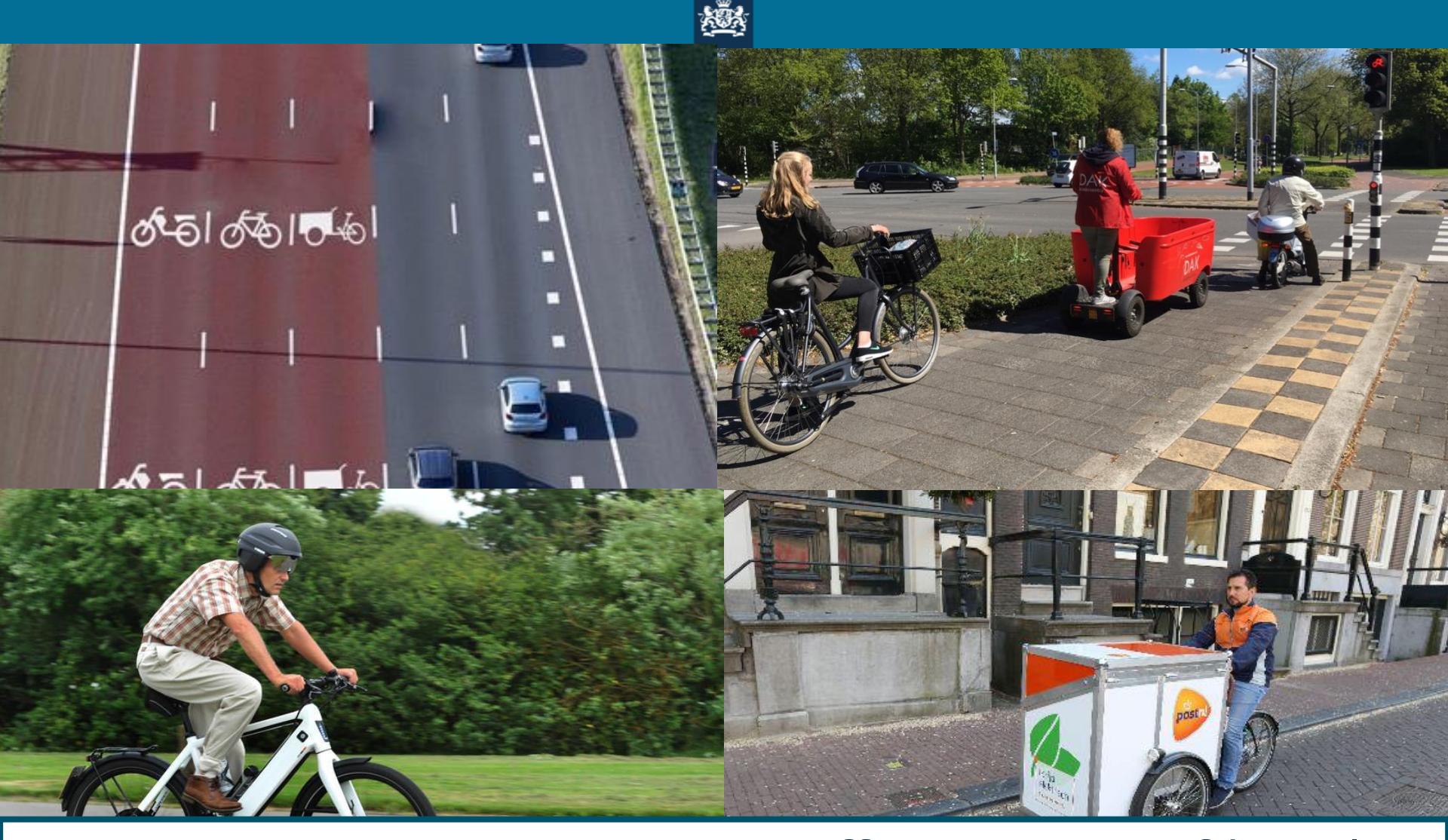
Different types of bicycles