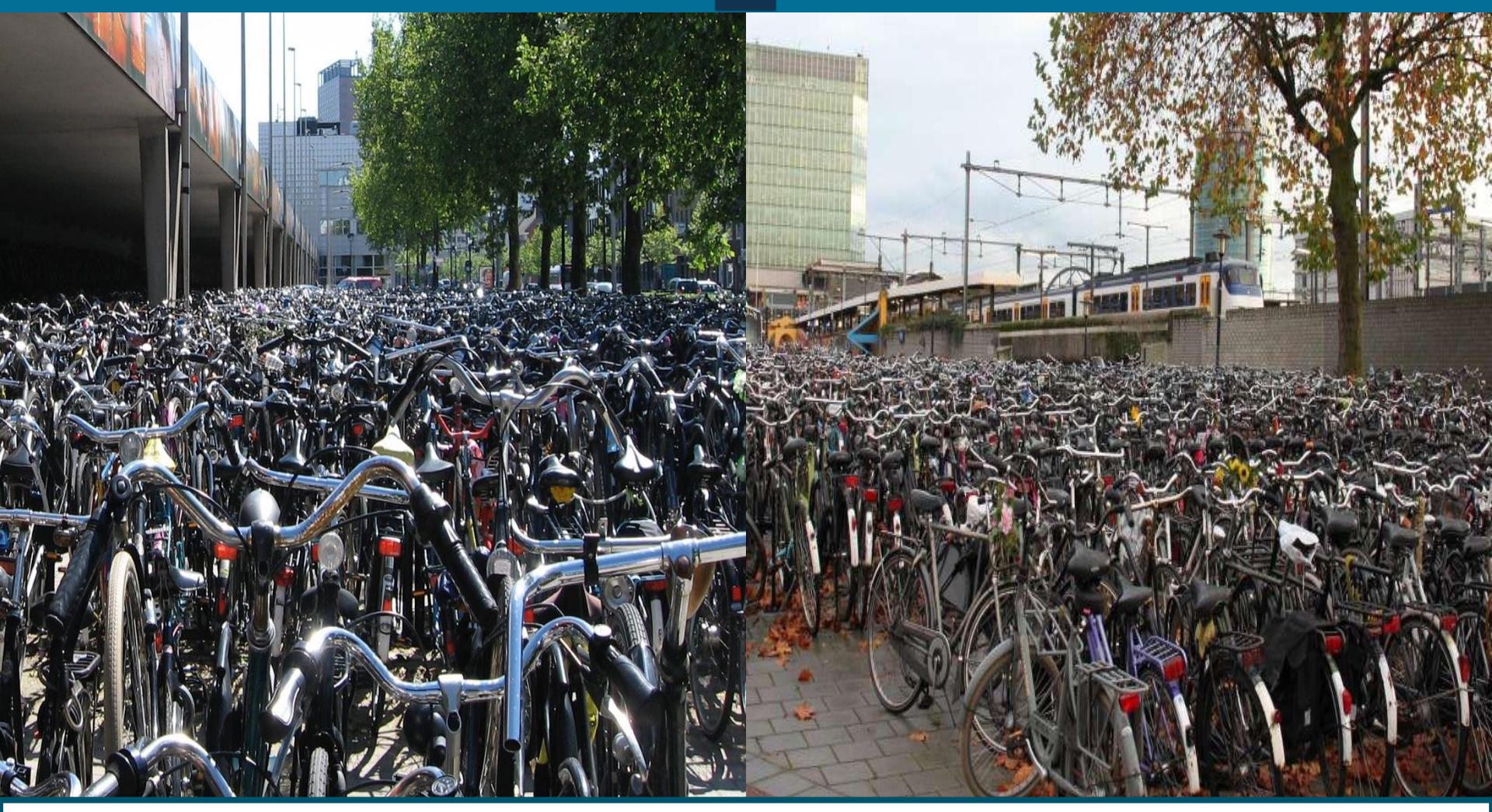
Bicycle parkings at train stations