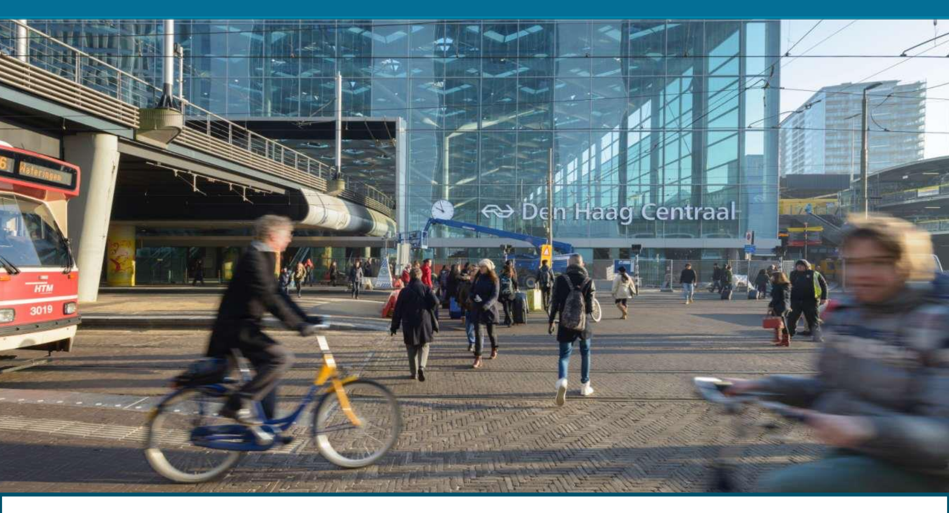
Cycle compared to Train?