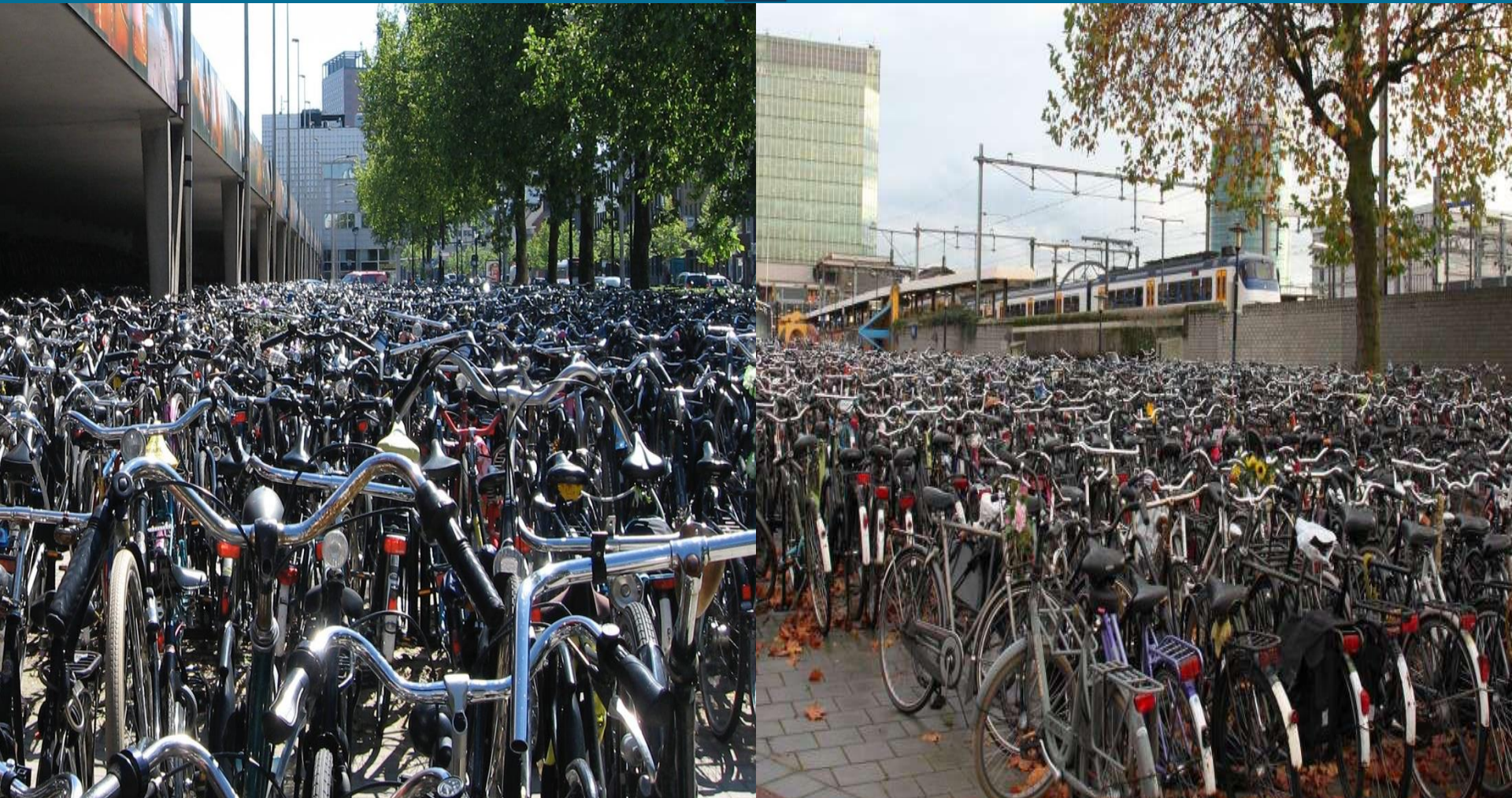
Bicycle parkings at train stations