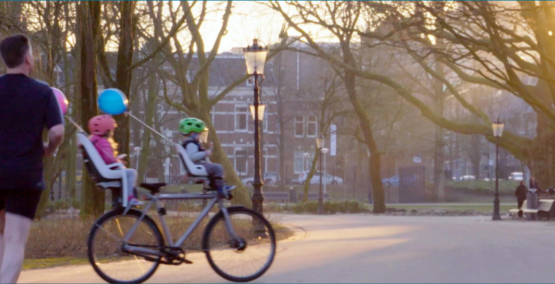
Self driving bike