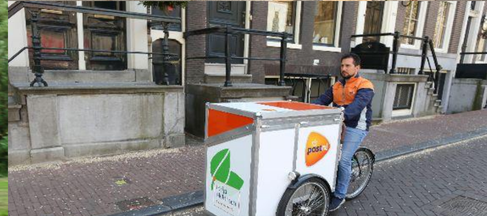
Different types of bicycles