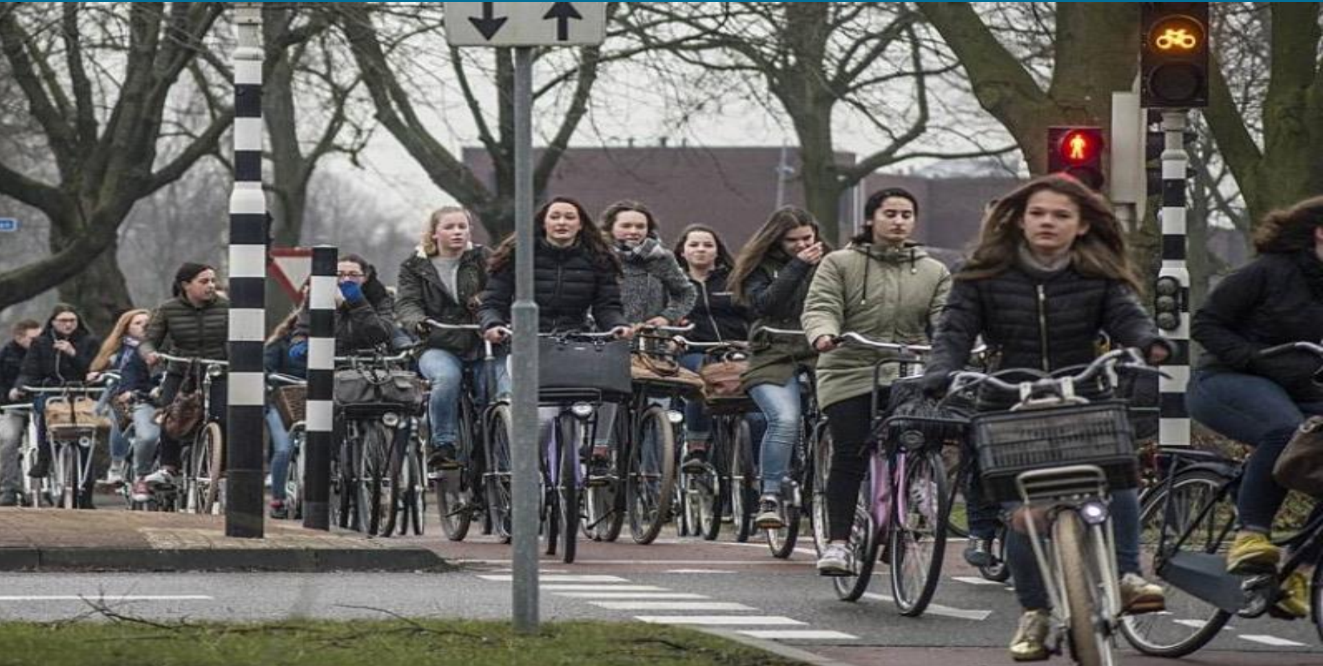
Bike traffic jams