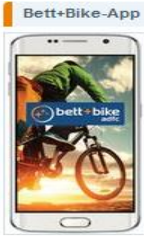
POIs for GPS